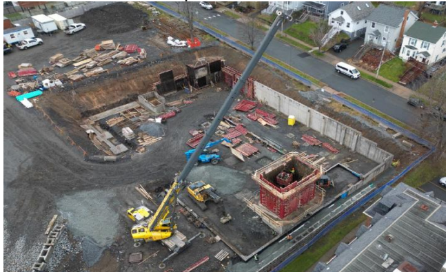
Foundations & Stairwell Construction