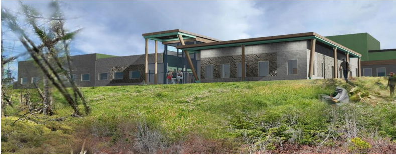
Rendering of approach to main entrance