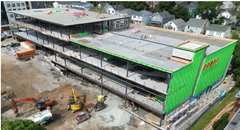
Building Structure - mid-August 2024