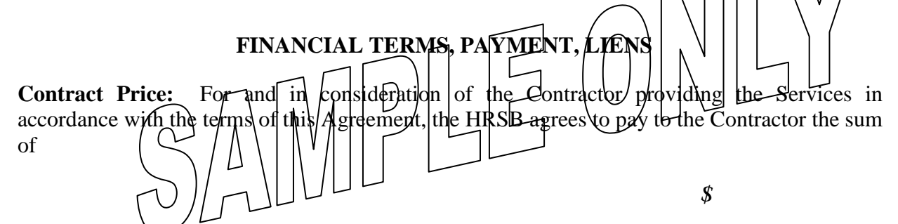
( plus HST ) hereinafter referred to as the Contract Price ". Such Contract Price shall include any and all expenses Contractor may incur in the performance of the Services.

Term : This Agreement shall commence upon and later expire upon the dates specified in Appendix "C" (such period being the " Term "), unless earlier terminated in accordance with the provisions of this Agreement. Should Contractor continue to provide, and HRSB continue to pay, for the Services beyond the Term, such provision of Services shall be deemed to be on a temporary basis only and terminable at any time by HRSB with or without cause, and the provisions of this Agreement shall apply in full force (save as to the termination provisions in Article 9) until such termination.