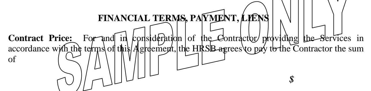
( plus HST ) hereinafter referred to as the Contract Price ". Such Contract Price shall include any and all expenses Contractor may incur in the performance of the Services.

Term : This Agreement shall commence upon and later expire upon the dates specified in Appendix "C" (such period being the " Term "), unless earlier terminated in accordance with the provisions of this Agreement. Should Contractor continue to provide, and HRSB continue to pay, for the Services beyond the Term, such provision of Services shall be deemed to be on a temporary basis only and terminable at any time by HRSB with or without cause, and the provisions of this Agreement shall apply in full force (save as to the termination provisions in Article 9) until such termination.