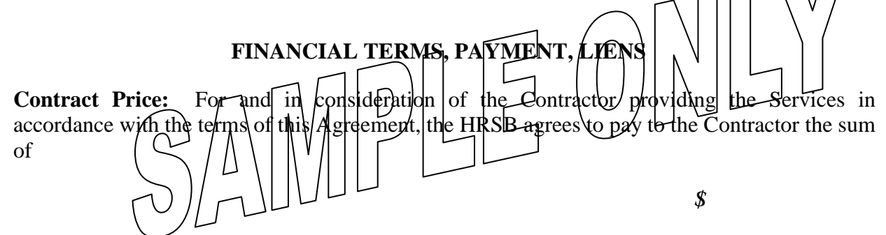
( plus HST ) hereinafter referred to as the Contract Price ". Such Contract Price shall include any and all expenses Contractor may incur in the performance of the Services.

Term : This Agreement shall commence upon and later expire upon the dates specified in Appendix "C" (such period being the " Term "), unless earlier terminated in accordance with the provisions of this Agreement. Should Contractor continue to provide, and HRSB continue to pay, for the Services beyond the Term, such provision of Services shall be deemed to be on a temporary basis only and terminable at any time by HRSB with or without cause, and the provisions of this Agreement shall apply in full force (save as to the termination provisions in Article 9) until such termination.